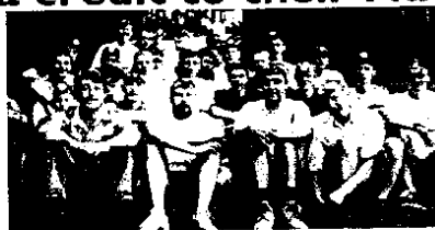
Outside Sudwala ready for the Crystal Caves Tour.

The Kruger National Park lived up to its name and revealed so much of its animal secrets, not to mention just the thrill of camping the night in the Park. A taste of Sabie, Gras-kop, and a peep through God's Window all added to the experience. Fox's Adventure took them up (and down!) the Barberton