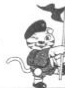
The Thai Tiger Jamboree Seal.