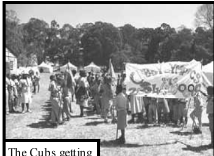
The Cubs getting ready for the Cubbylympics