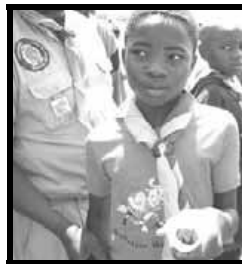
One of the Scouts holding an insect he found.

The Scouts and Guides had fun on the Dry and Wet obstacles Courses, Problem Solving Challenge and playing Volley Ball.