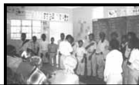
The Cubs singing to entertain the elderly folk in the classroom

We invited them to a special day when we entertained them with music, to say thank you for giving support to some of the youth whose parents had died. Some of them are sick as well as jobless. We gave them some vegetables from the school garden and also Thank you Cards.