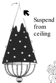
Suspend from ceiling