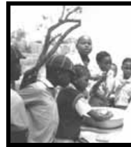
The Cubs peeling potatoes for the soup