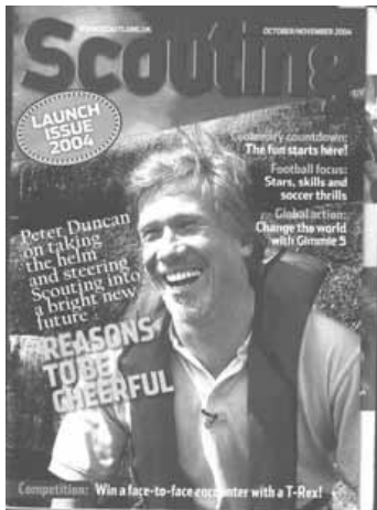
Peter Duncan, newly appointed Chief Scout of Great Britain, featured in "Scouting" magazine.

Yes, it is the P.R.— Public Relations —of the Promise because of the commitment of all Cubs, Scouts, Rovers and leaders; Brownies, Guides, Ranger Guides and Leaders, the ideals and values of Scouting and Guiding are reflected through and by the actions of its members. And the P.R.— Privilege and Responsibility —of the Promise rests with the Scouter or Guide to introduce it to the brand new Cub, Scout, Brownie or Guide. To lead that young person to continue faithfully and fully committed to our Promise for the rest of his or her life!