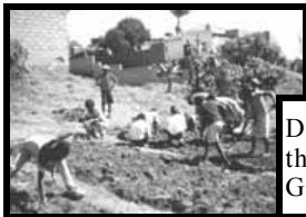
Digging the Family Garden.

'In June I identified a learner whose family was not in a good condition due to illness. The mother was unable to fill in a Consent form because she was too sick. I visited the family and asked the lady if the Cubs could help her by making a vegetable garden for her family, which she appreciated very much. In July, 25 Cubs volunteered to do the job, which we completed in 2