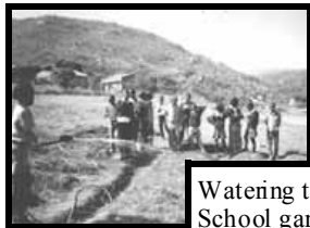
Watering the School garden.

Seeing that we had a feeding scheme at Tenteleni School, we decided to make another garden to support the feeding