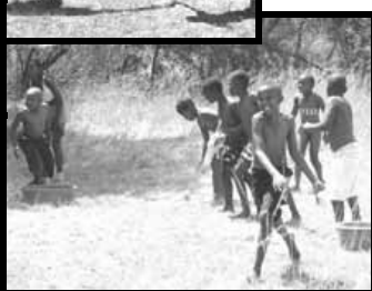
And the "Waterlympics" was such fun!