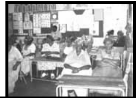
The Grannies looking forward to the meal and entertainment.