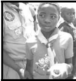
One of the Scouts holding an insect he found.

The Scouts and Guides had fun on the Dry and Wet obstacles Courses, Problem Solving Challenge and playing Volley Ball.