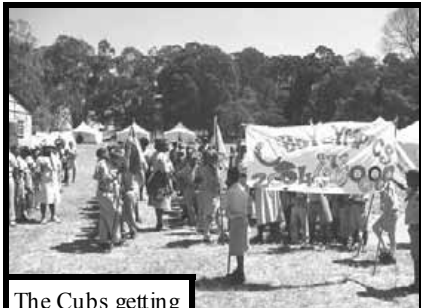
The Cubs getting ready for the Cubbylympics